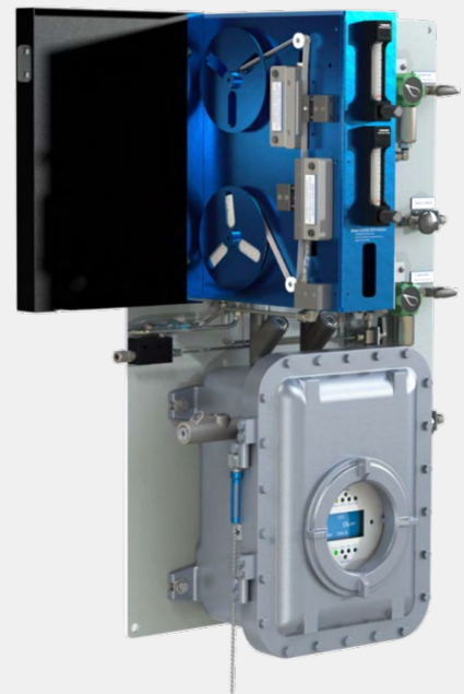
330SDS Standard Sample Conditioning System with Open Deck Lid