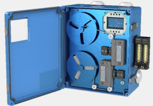
Envent Model 331SDS