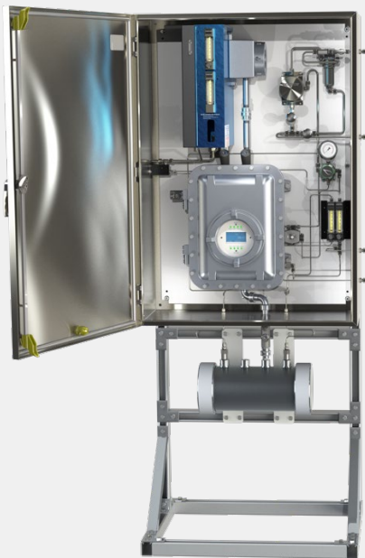
330SDS H 2 S and Total Sulfur Analyzer with Auto-Calibration in Stainless Steel Enclosure