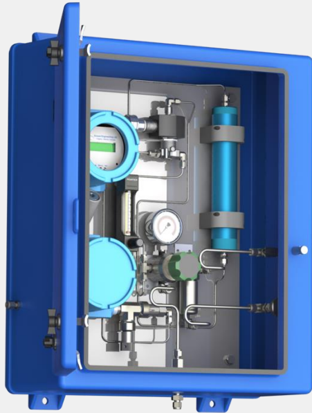
M70XP Moisture Monitor with Auto-Zero in a Fiberglass Enclosure