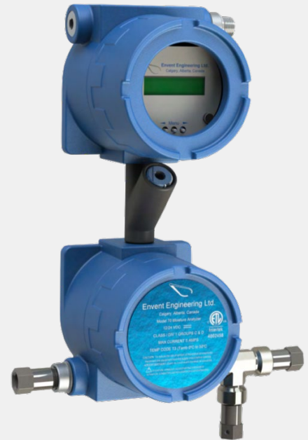
M70XP Moisture Monitor