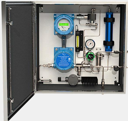
M70XP Moisture Monitor with Auto-Zero in a Heated, Insulated Carbon Steel Enclosure