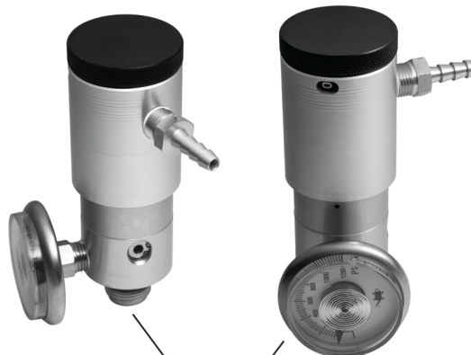
Single stage design Part # shown above: 50-11387-01