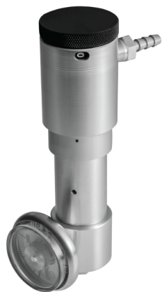
Two stage design Part # shown above: 50-11573

1590 99th Ln NE, Minneapolis, MN 55449 763-786-4020