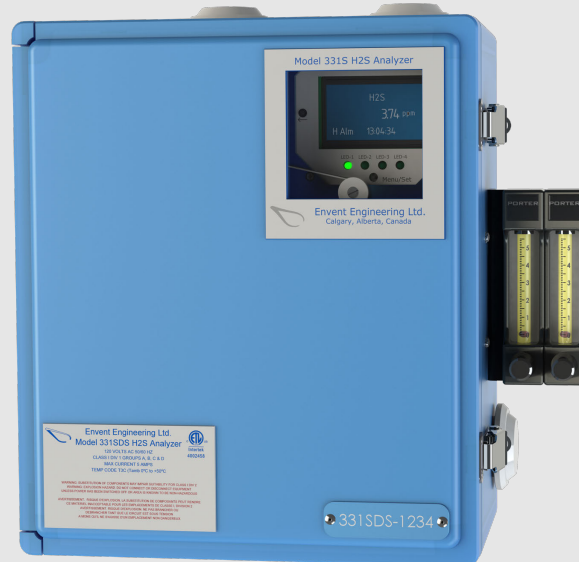
331SDS H 2 S Analyzer