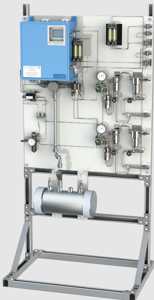
331SDS H 2 S-Total Sulfur with Modified Saturated Dirty Sample Conditioning