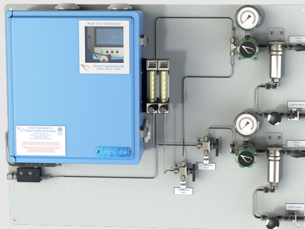
331SDS Standard Sample Conditioning System